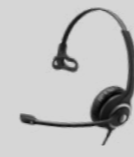
COMMAND SC 230 ATC/C3 AG