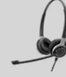
COMMAND SC 660 ATC/C3 AG