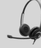
COMMAND SC 260USB PTT