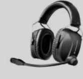
COMMAND HME 110 ATC