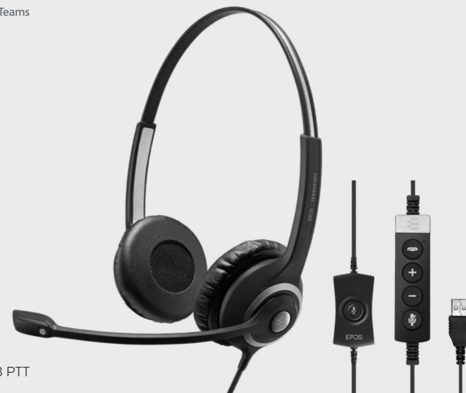
SC 260 USB PTT