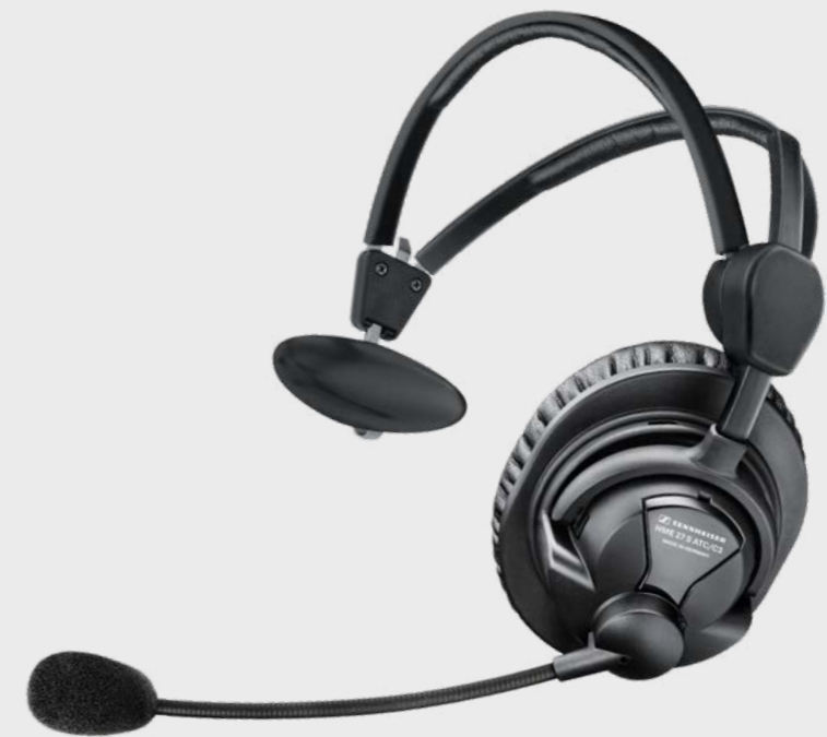
HME 27 Series

Superb wearing comfort with patented two-piece automatic headband and soft circumaural ear pads