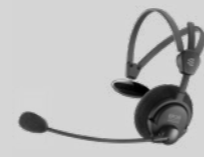
COMMAND HME 46-3S-II