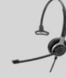
COMMAND SC 630 ATC/C3 AG