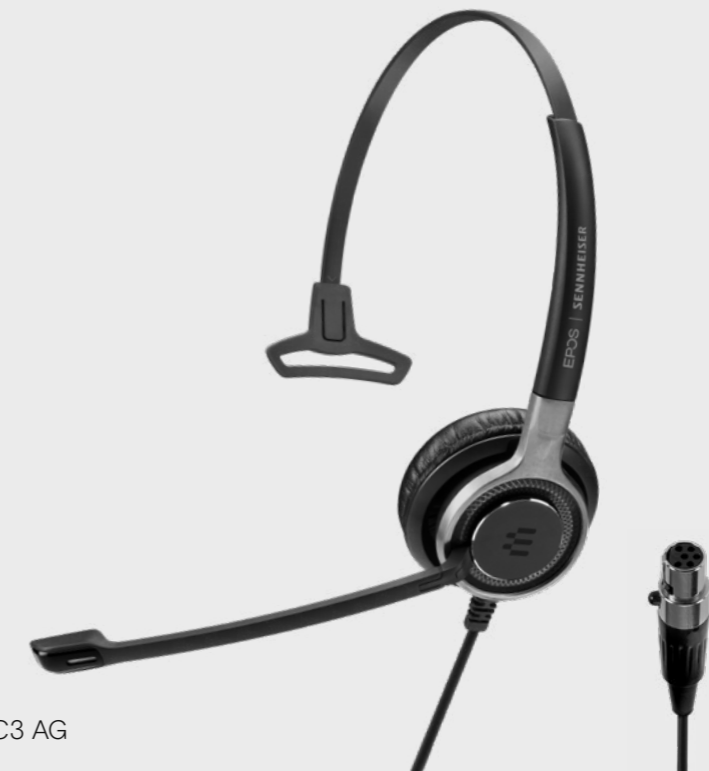
SC 630 ATC/C3 AG