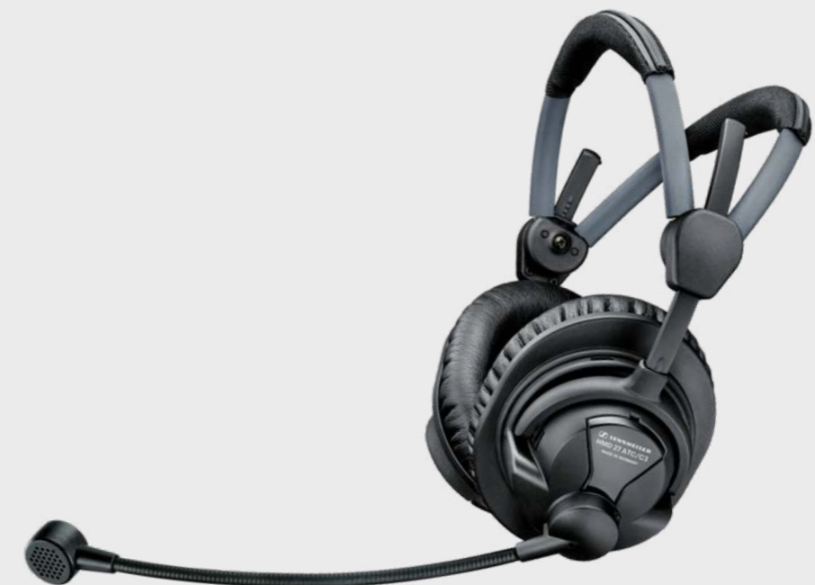
HMD 27 Series