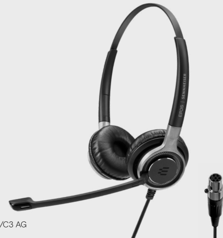
SC 660 ATC/C3 AG

With fully adjustable headband and generous leatherette ear pads made to maximize comfort