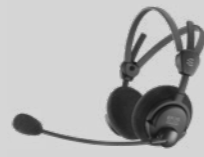
COMMAND HME 46-3-II