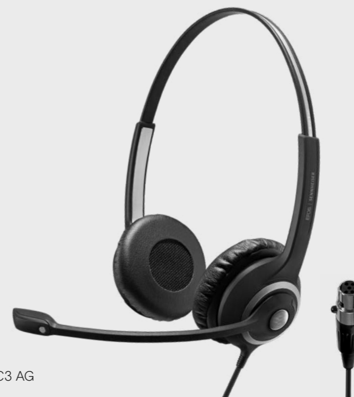
SC 260 ATC/C3 AG