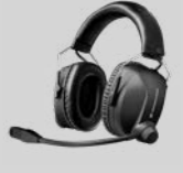
COMMAND HME 110 C3