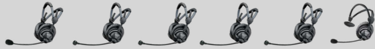
COMMAND HME 27 ATC/C3 300 Ω COMMAND HMD 27 w. std. boom COMMAND HMD 27 ATC/C3 w/o AG COMMAND HMD 27 ATC/C3 w. 5 ohm Mic COMMAND HMD 27 ATC/C3 5 ohm w/o AG COMMAND HME 27 S ATC/C3